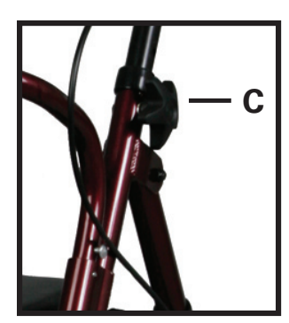
Figure 2: Knob Screw