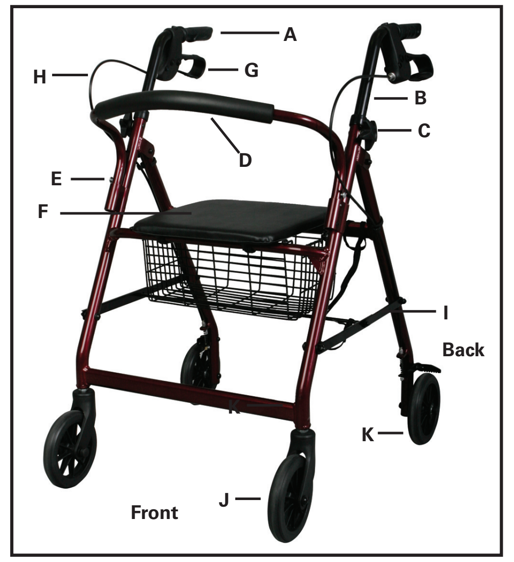
Figure 1: Assembled Rollator

Note: You may wish to request a set up and operating demonstration with your local Medical Equipment provider or pharmacy.